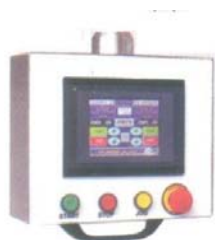
Man Machine Interface